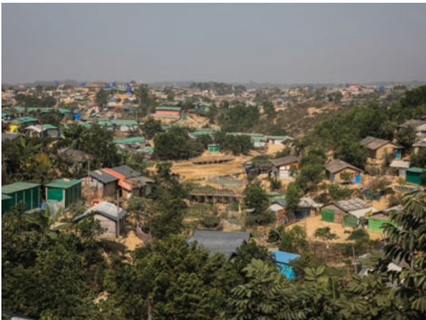
BANGLADESH Kutupalong refugee camp, Bangladesh.