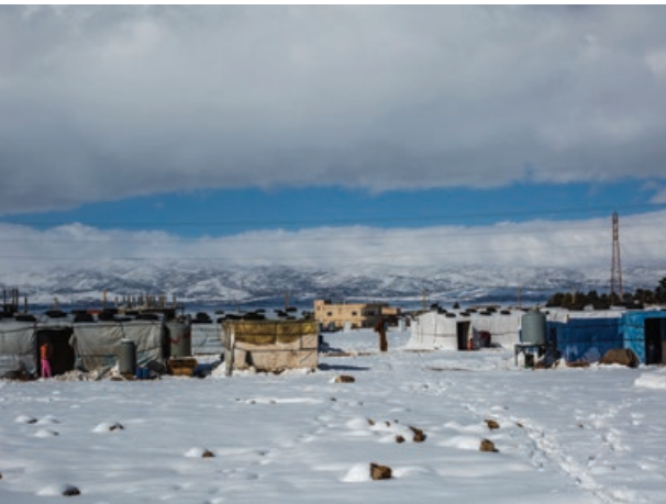
LEBANON Winter descends on Syrian refugees in informal settlements, Lebanon.